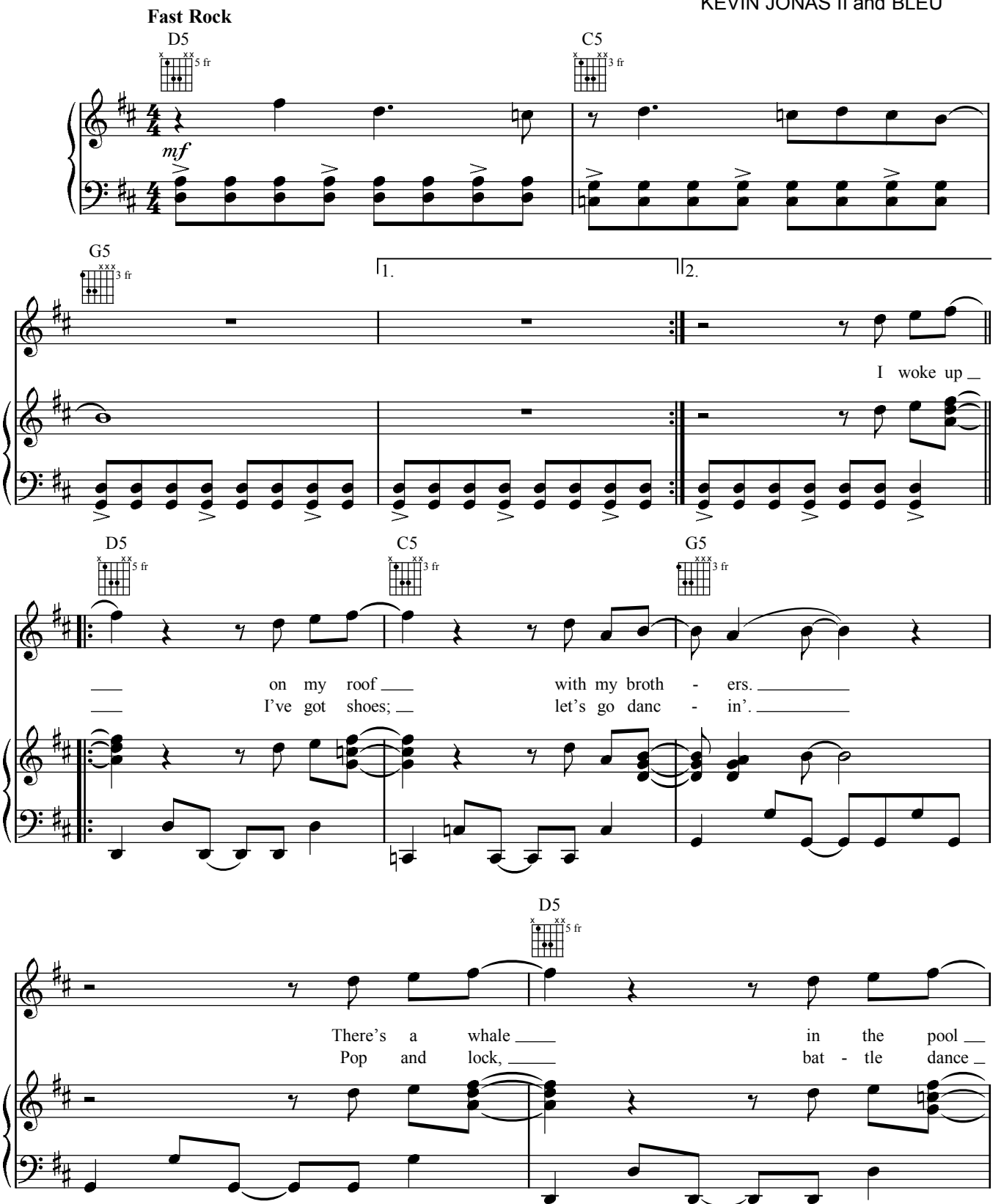
Copyright ⊚ 2007 Sony/ATV Songs LLC, Jonas Brothers Publishing LLC and Bleu Publishing Designee All Rights on behalf of Sony/ATV Songs LLC and Jonas Brothers Publishing LLC Administered by Sony/ATV Music Publishing, 8 Music Square West, Nashville, TN 37203 International Copyright Secured All Rights Reserved

Words and Music by NICHOLAS JONAS, JOSEPH JONAS, KEVIN JONAS II and BLEU