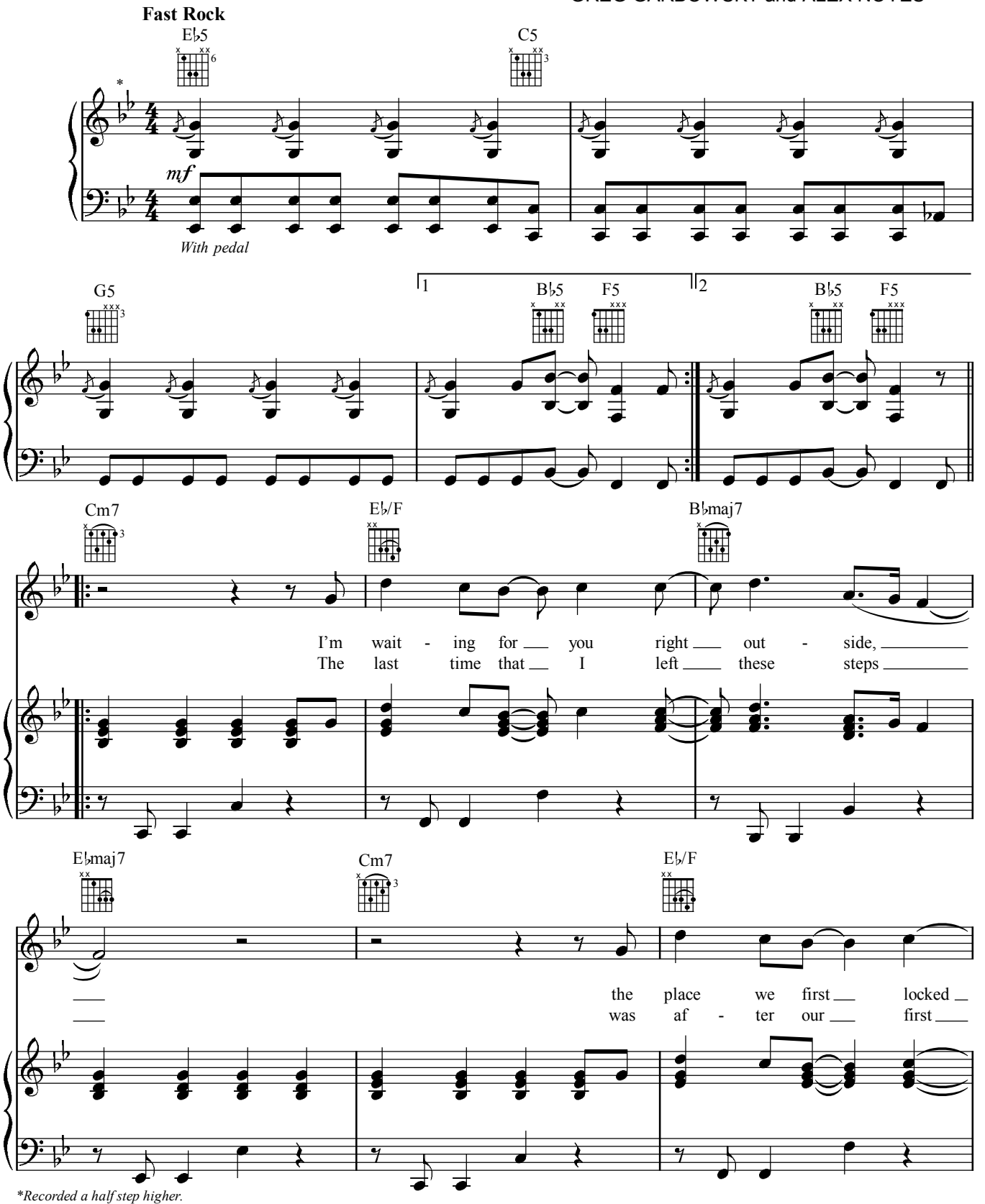
Copyright © 2007 Sony/ATV Songs LLC, Jonas Brothers Publishing LLC and Rebel Dragon Entertainment All Rights on behalf of Sony/ATV Songs LLC and Jonas Brothers Publishing LLC Administered by Sony/ATV Music Publishing, 8 Music Square West, Nashville, TN 37203 International Copyright Secured All Rights Reserved