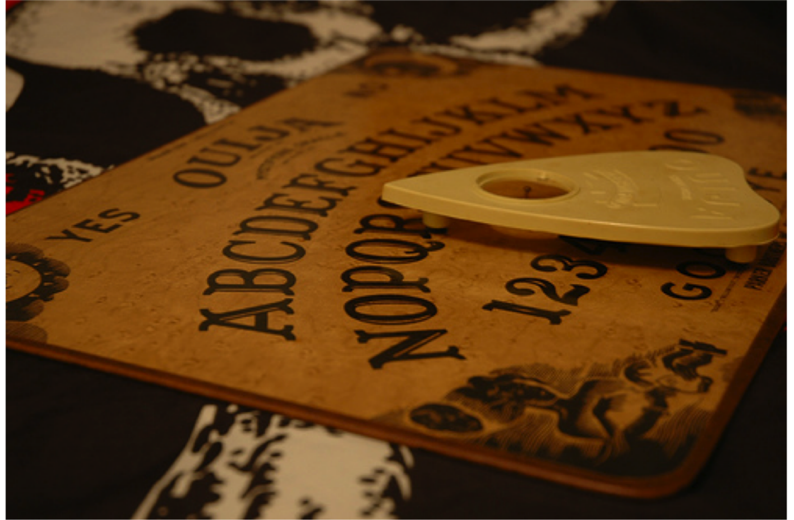
A board ouija - Mystifying oracle